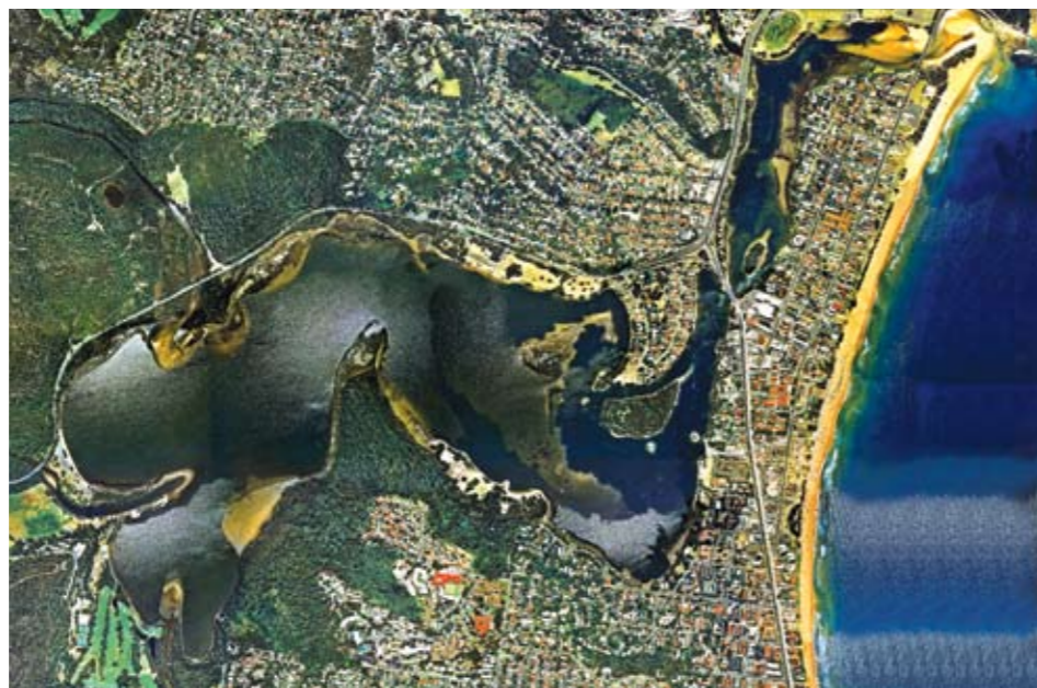
The Narrabeen Lagoon catchment