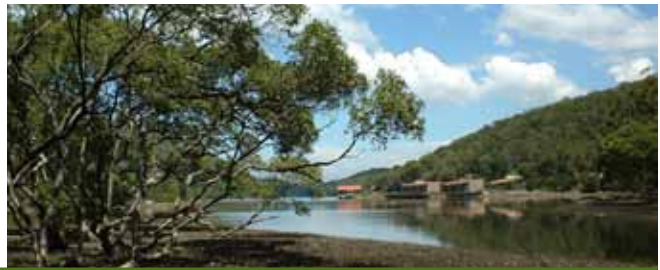
Table 20: Non-Aboriginal Heritage