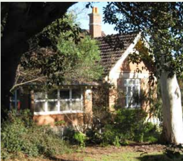
Mosman Police Station.

The upgrade and rehabilitation of Clifton Gardens jetty commenced in 2009, with the reconstruction of the dilapidated jetty head taking priority due to its heritage value. The refurbishment was undertaken to improve the jetty for public access and maintain its aesthetic and heritage features.