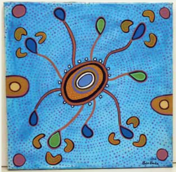
Guringai Festival. Painting by Bibi Barba. Source: Pittwater Council

In 2010 a special dinner was held at the Northern Beaches College - TAFE to mark the handing over from Council to the TAFE of a magnificent seven metre long mural which was created by local children who participated in the 2009 Guringai Festival 'Star Dreaming Rainbow Serpent' event at Glen Street Theatre.