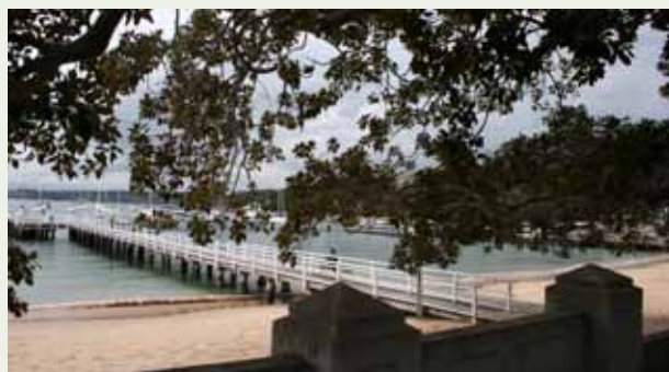
Balmoral Jetty.

Mosman's Draft LEP 2010, which was developed during 2009/10 and is expected to be gazetted by the end of 2010, will include two new Heritage Conservation Areas, and seven new heritage items. The Glover and Nathan's Estates draft heritage conservation area covers approximately three hundred semi-detached and detached dwellings, and is representative of the type of late 19th century and early 20th century residential development in Mosman.