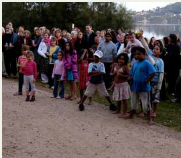
Guringai Festival Sorry Day.